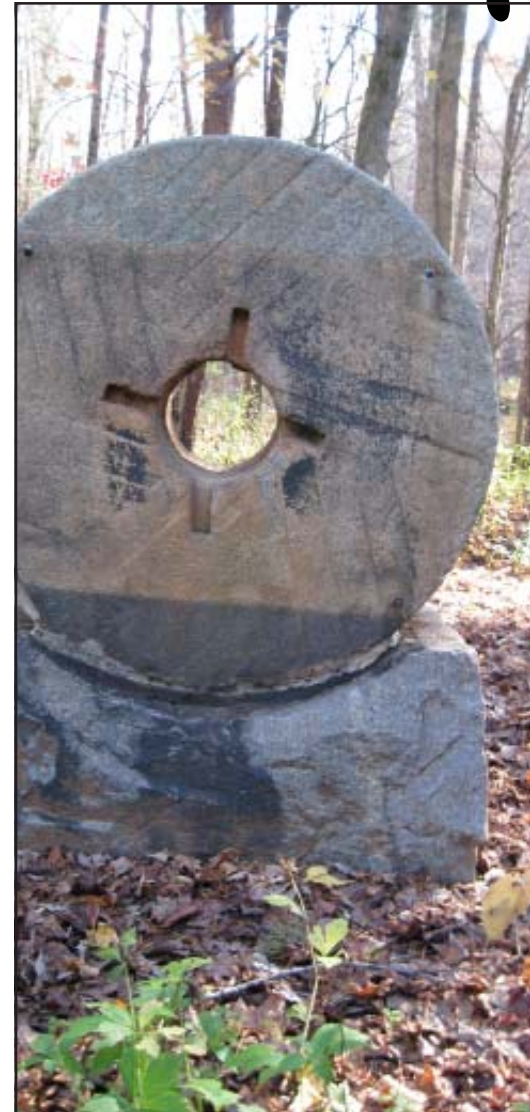
Bethabara Mill runner stone.