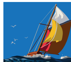
You can't direct the wind, but you can adjust your sails.

For new information about the Accessibility Code from DOI go to www.ncdoi.com/OSFM/Engineering/engineering_newsletter.asp Click on May 19,2009 newsletter