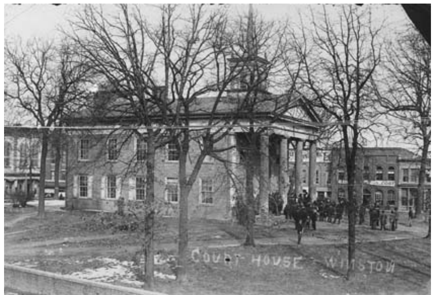
The first Courthouse on Courthouse Square faced south.