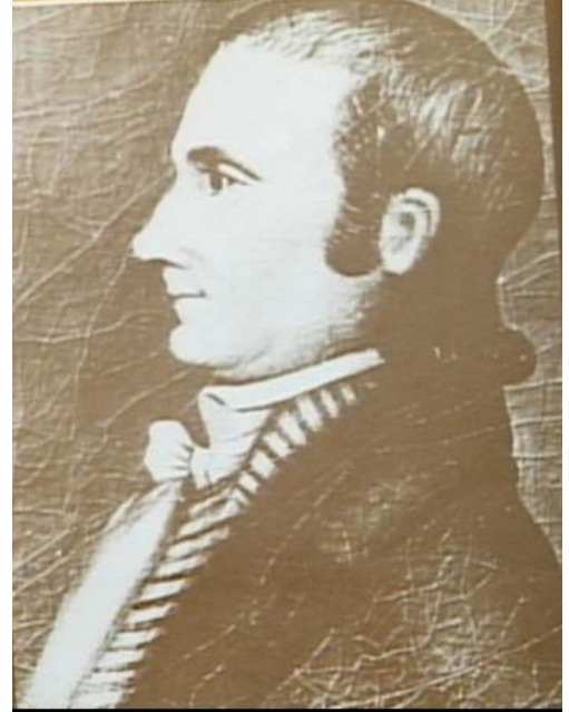
Major Joseph Winston

The naming of the county town was the next step, and an attempt was made to have this done by a popular vote. The plan was to hold an election and take the name which had the largest number of votes. This plan failed, and January 15, 1851, the legislature passed an act which declared that "hereafter the county town of Forsyth County shall be styled and known by the name of Winston." The name was given in honor of Major Joseph Winston, a prominent North Carolinian, who figured in the War of the Revolution, and was also active in the political development, both state and national. Major Winston was born June 17, 1766, in Virginia, and died in Germantown, North Carolina, April 21, 1815. He is buried at the Guilford Courthouse National Military Park in Greensboro in which he had participated.