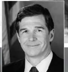
NC Attorney General Roy Cooper