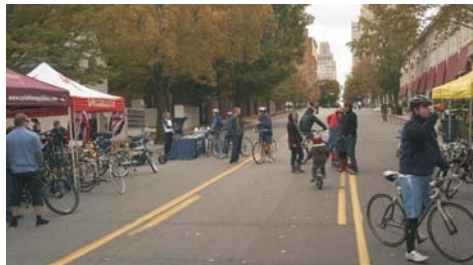
Bicycle shops provided tune-ups on 4th Street.

Winston-Salem held its first Cycling Sundays event on October 18th. City staff partnered with local restaurants, businesses, bike shops, and numerous volunteers to create an afternoon of safe bicycling on the streets of downtown Winston-Salem. A one-mile stretch of roadway was closed to automobile traffic and opened strictly for bicyclists and pedestrians, where they could ride and walk in a safe environment. About 200 people of all ages and backgrounds attended the event on a cold and windy day to take advantage of the quiet streets. With the success of the event, additional Cycling Sundays dates are being planned for 2010, with the event likely to occur on a monthly basis.