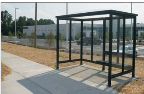
New Goodwill siteplan provided a bus shelter.