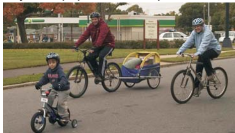
A family enjoys a traffic free ride downtown.