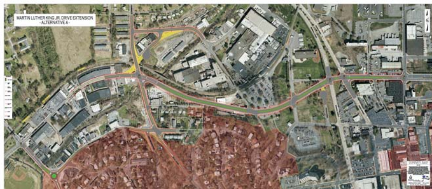
Proposed Alternative A for Martin Luther King, Jr. Drive Extension.

The Martin Luther King, Jr. Drive Extension Study recommends a new alignment for the road west from the intersection of Eighth Street at Cherry/Marshall Streets running generally parallel to the Norfolk Southern railroad to a signalized intersection at Broad Street connecting with a realigned Northwest Blvd. Improvements to Reynolda Road with a roundabout at West End Boulevard are included in the scope of the project. The MLK, Jr. Drive extension will be a two-lane median divided facility with bicycle accommodation and sidewalks and is designed to improve safety and provide an attractive residential boulevard. The draft document is at dot.cityofws.org . The final document will include a no-build alternative.