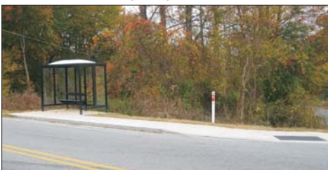
New bus shelter with ADA compliant ramp.

As part of the inventory, stops with inconvenient or hazardous conditions were specially noted. Remedies may call for moving some stops to safer locations or removal of dangerous or ADA noncompliant stops altogether.