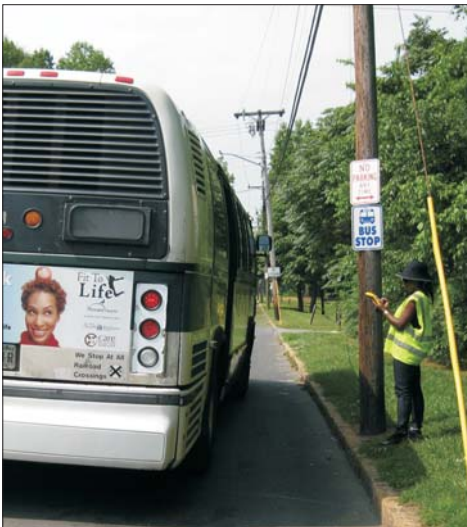
Handheld GPS inventory of bus stop locations.

The Winston-Salem Department of Transportation (WSDOT), in cooperation with the Winston-Salem Transit Authority (WSTA) and the Piedmont Authority for Regional Transportation (PART), is currently conducting a comprehensive Transit Stop Inventory and Assessment of over 1,000 transit stops in the Winston-Salem Urban Area. The project involves three main stages including data collection, data analyses, and policy recommendations that will guide transit stop improvements to the system. The primary goal of this project is to improve the overall infrastructure of the transit system and thereby make the system as efficient, safe and user friendly as possible for transit riders.