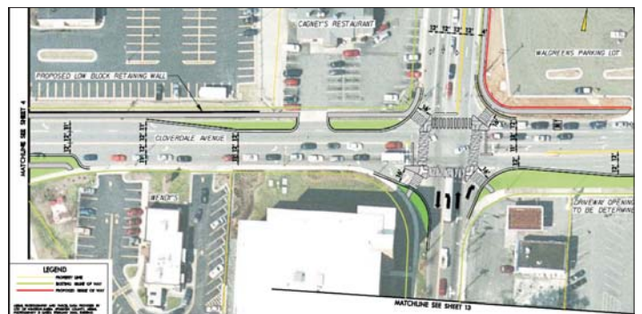
Proposed Improvements to Cloverdale Avenue at Miller Street.

A study of the pedestrian environment and major intersections on Cloverdale Avenue from Oakwood Drive to Hawthorne Avenue and on Miller Street from Five Points to Queen Street is almost finished. Final recommendations will be made in early 2010. The plan is available online at dot.cityofws.org .