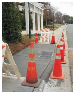
Installing a handicapped ramp.