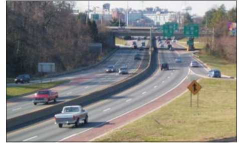
US 52 north of the Stadium Drive Interchange

Monday, March 10 John F. Kennedy Learning Center 1000 N. Highland Ave. Open House 4:30 to 6:30 p.m. Public Hearing Begins at 7:00 p.m.