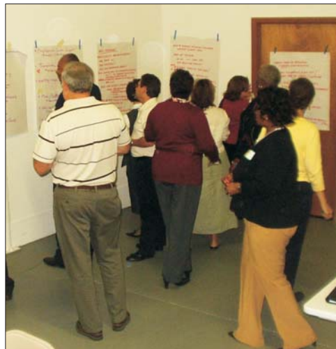
Coordination Plan workshop participants rank needed transit services for dependent populations.