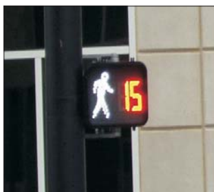
New pedestrian signals downtown.