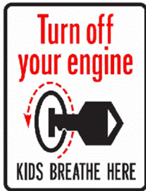
Figure 31: Idle Free Zones, Forsyth County Environmental Affairs

The Safe Routes to School program is a national and international movement to enable and encourage elementary and middle school children to walk and bicycle to school. Through the use of the "5 Es", engineering, education, enforcement, encouragement and evaluation, programs and projects can be developed to create a safe, appealing environment for walking and biking to school that will encourage a healthy and active lifestyle from an early age. Safe Routes to School will also enrich the quality of our children's lives and benefit communities by implementing projects and activities that will reduce traffic congestion, improve air quality, and enhance neighborhood safety. Safe Routes to School is seen as one vital step toward reducing the alarming nationwide trend of child obesity and inactivity.