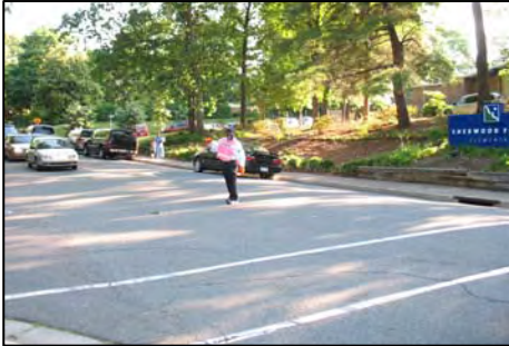
Figure 33: Crossing Guard at Sherwood Forest Elementary School

As traffic continues to increase on North Carolina's streets and highways, concern has grown over the safety of our children as they walk to and from school. At the same time, health agencies, alarmed at the increase in obesity and inactivity among children, are encouraging parents and communities to get their children walking and biking to school. In response, the Division of Bicycle and Pedestrian Transportation funded a study on pedestrian issues, including school zone safety, and decided to establish a consistent training program for law enforcement officers responsible for school crossing guards. According to the office of the North Carolina Attorney General, school crossing guards may be considered traffic control officers when proper training is provided as specified in North Carolina General Statutes 20-114.1