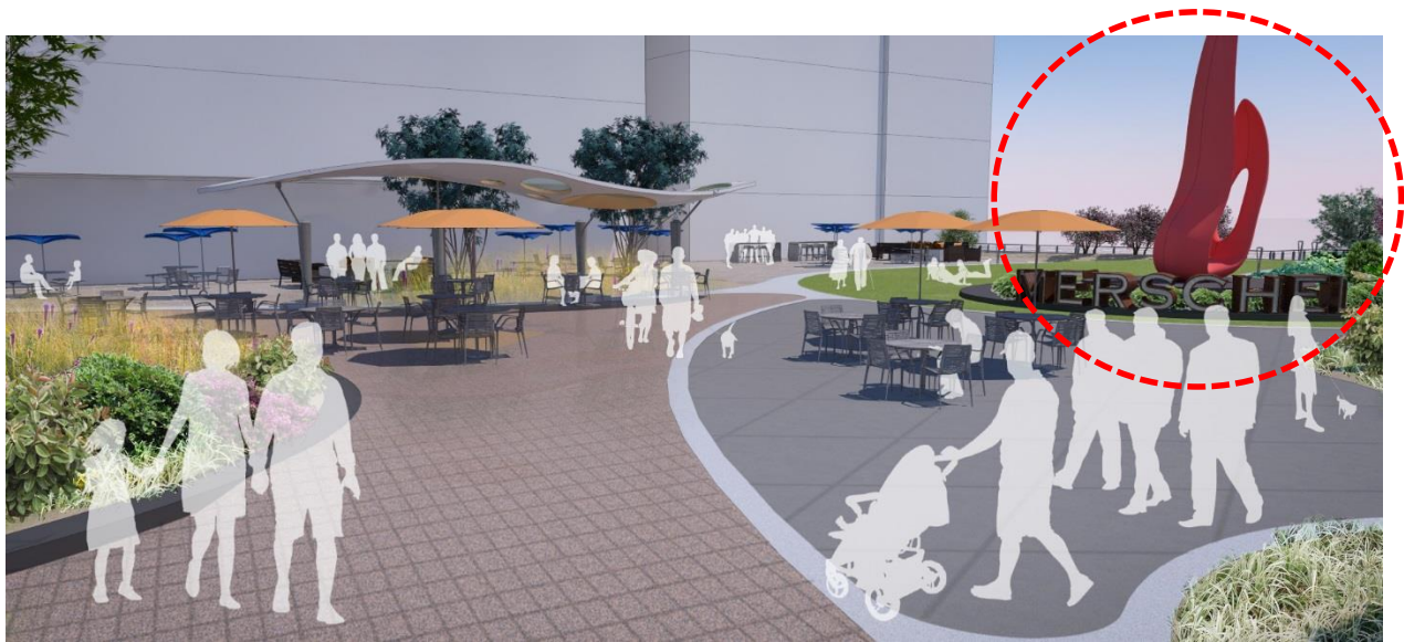
Merschel Park Perspective Rendering - Facing South