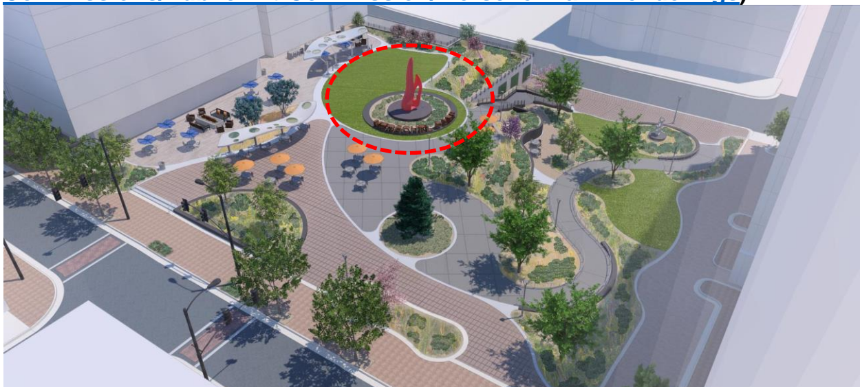
Merschel Park Perspective Rendering - Facing South

http://www.cityofws.org/Departments/Planning/Boards-and-Commissions/Public-Art-Commission/Merschel-Park-Renderings )