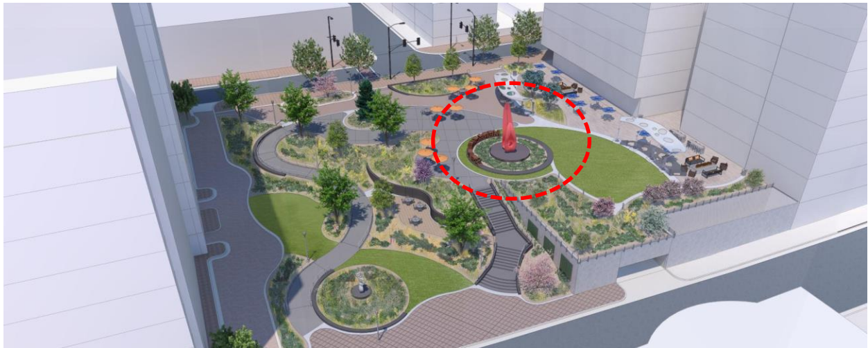
Merschel Park Perspective Rendering - Facing North