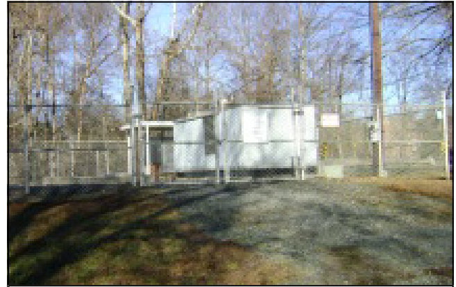
Clemmons No. 1 Lift Station