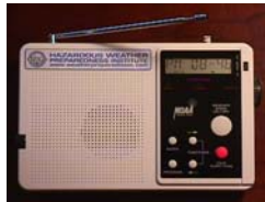
NOAA Emergency Alert Radio