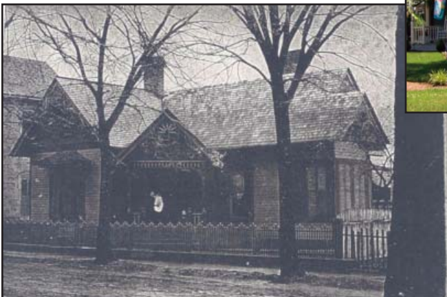
Henry C. Körner House, Date Unknown