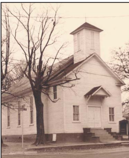
St. Paul United Methodist Church, Date Unknown

Today Saint Paul United Methodist Church remains in use as a church.